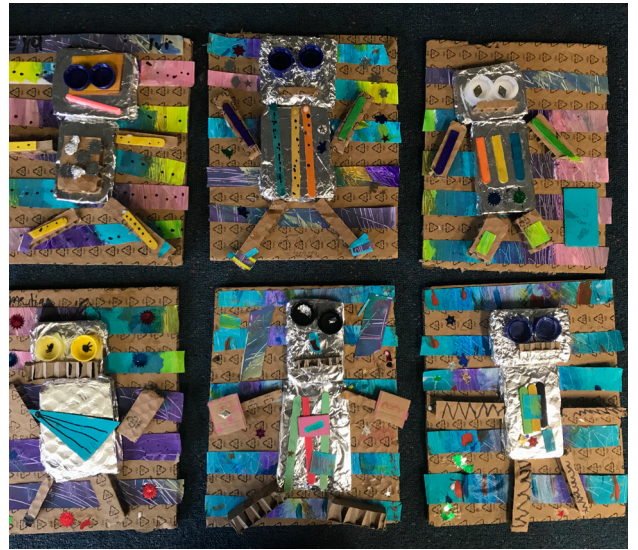
Recycled Robots by K Kangaroo and K/1 Koala

Students worked in small groups to create low relief sculptures using a variety of recycled materials.