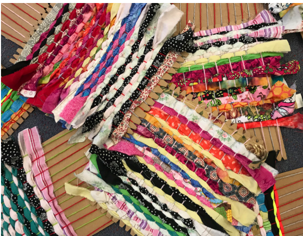
Weaving by 1/2 Platypus and 2 Possum