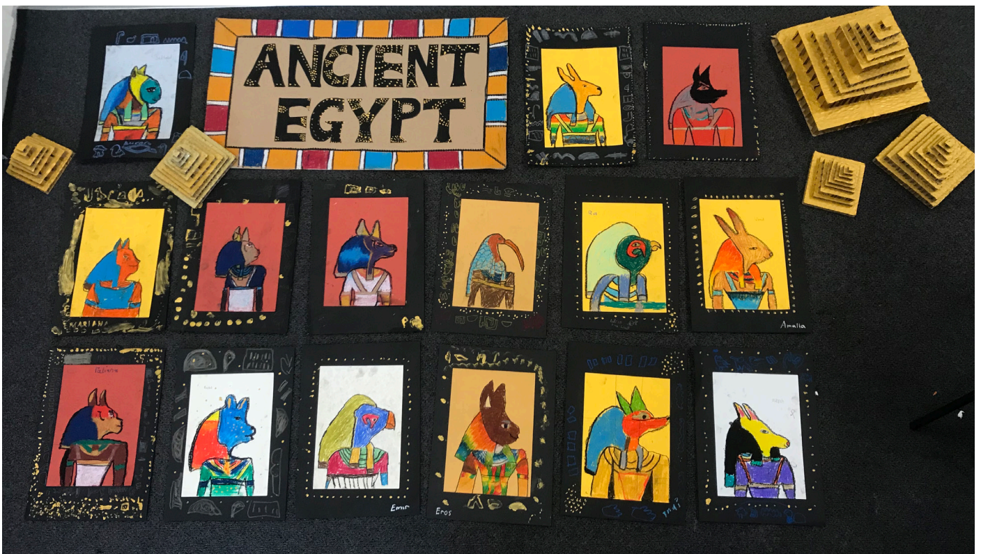
Egyptian Gods and Goddesses by 3/4 Emu, 3/4 Kookaburra and 4 Wombat

Stage 2 used the grid drawing method to complete their Egyptian Gods. They then learnt about colour blending using oil pastels. Finally students create frames for their artworks using metallic paint. They were encouraged to use Egyptian patterns and hieroglyphs to inspire their frames.