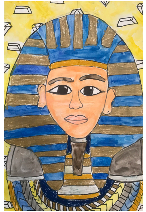
Egyptian Queens and Pharaohs by 5/6 Zebra and 5/6 Iguana

Students used teacher examples to complete their own Egyptian Pharaoh or Queen. Students were encouraged to use Egyptian inspired colours and patterns to complete their artwork.