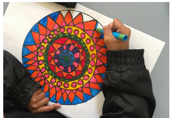
Mandalas by 3/4 Emu, 3/4 Kookaburra and 4 Wombat