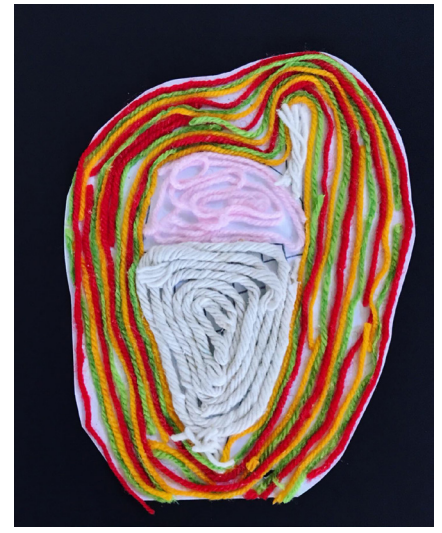
Yarn painting by 4 Wombat

Stage 2 learnt about Huichol Yarn Painting a traditional Mexican artform and observed the use of symbolism in these artworks. They then had to draw a variety of symbols and designs that represented them and create a yarn painting of their own.