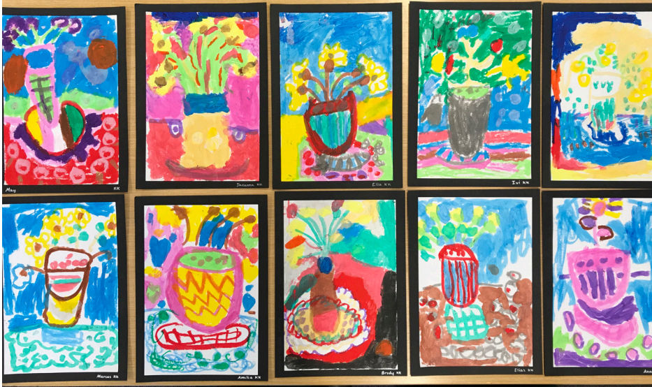
Sunflowers by K Kangaroo and K/1 Koala