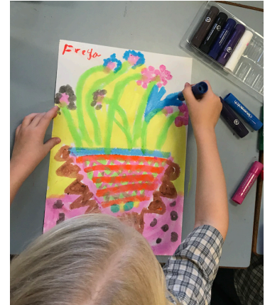
Student used paint sticks to create these beautiful flower vases.