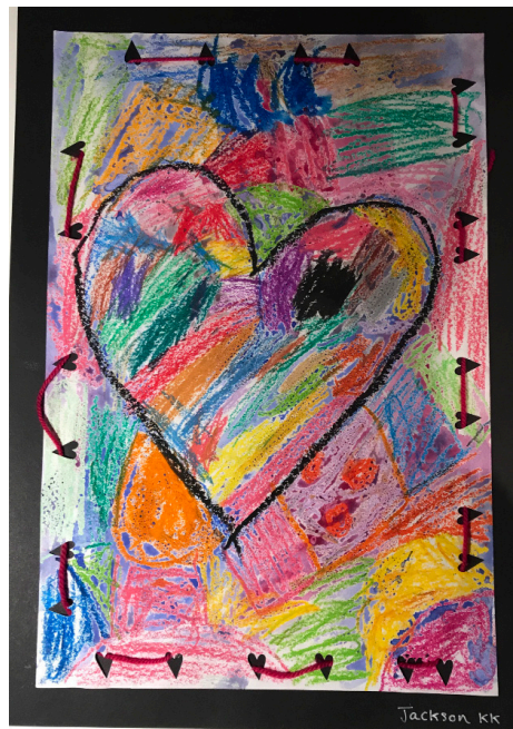
Hearts by K Kangaroo and K/1 Koala

Inspired by the artist Jim Dine, students created their own hearts using oil pastels and paint resist. Students completed this artwork by weaving wool around the border.