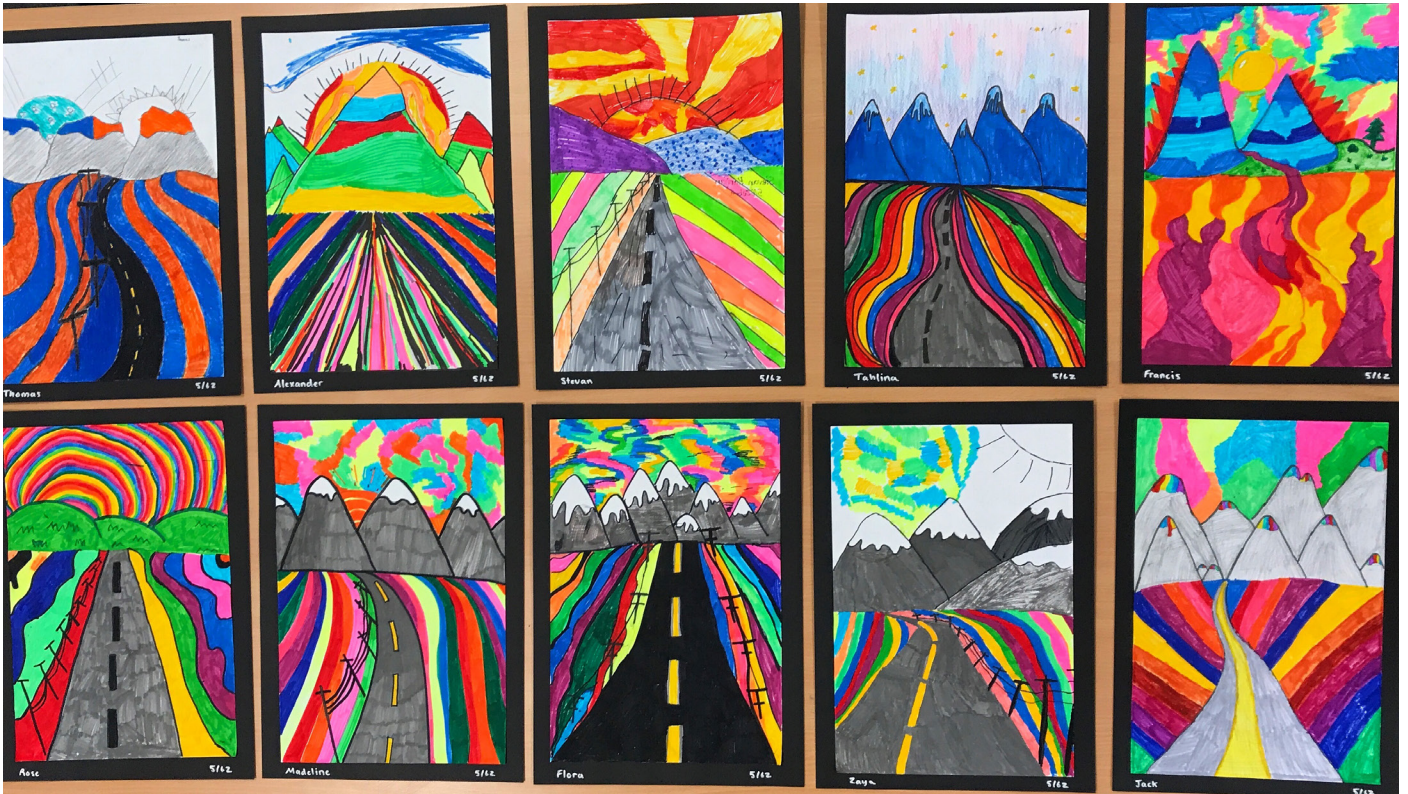
Roads by 5/6 Zebra & 5/6 Iguana